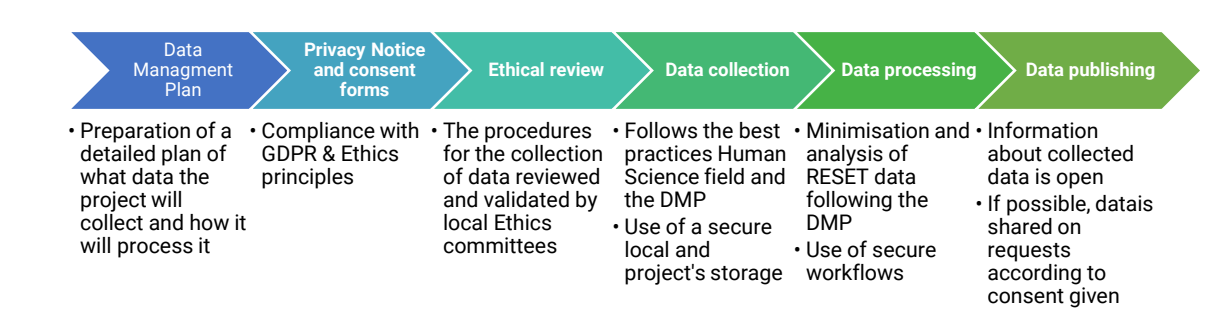
Figure 3: RESET Data Management procedure