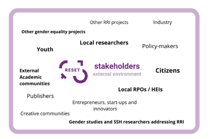
Figure 2: RESET Stakeholders - The external environment

The pre-existing data to be harvested or generated and utilised during the project's implementation include mainly data collected through literature review and deskresearch, as well as already available datasets produced by the partners' organizations.